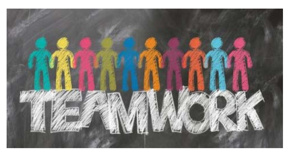
TEAMWORK MAKES THE DREAM WORK

https://www.facebook.com/events/485661262731465/ Sound like an interesting fundraiser? Questions??? contact Rotarian Jeff Main: 812-360-6934 or jmain@rwbaird.com